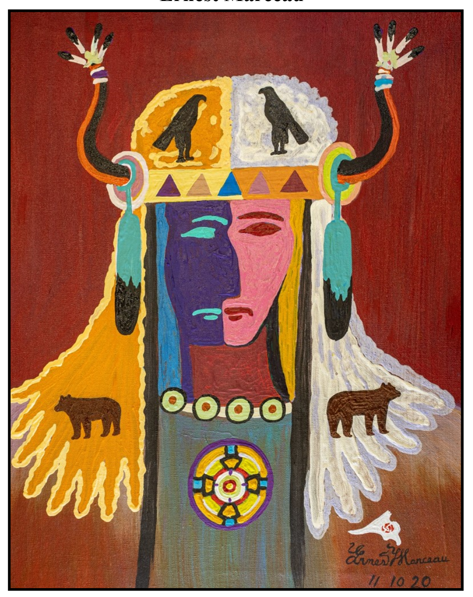
Warrior of Two Worlds Acrylic on Stretched Canvas © 2020 Ernest Marceau