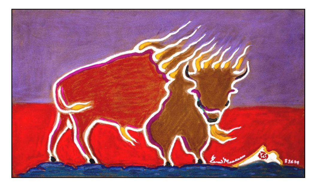
Little Bull Pastel and Acrylic on Velvet © 2019 Ernest Marceau