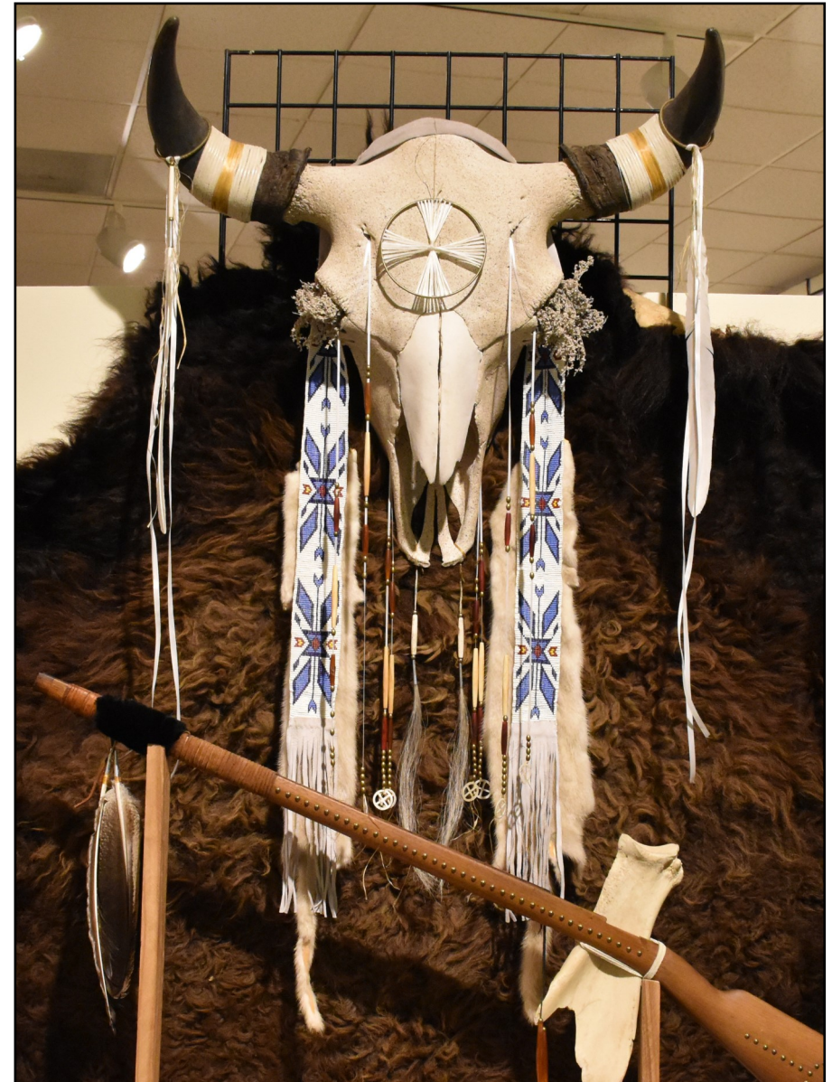
White Buffalo Calf Woman Mixed Media (Foggma) © 2020 Jerry Fogg