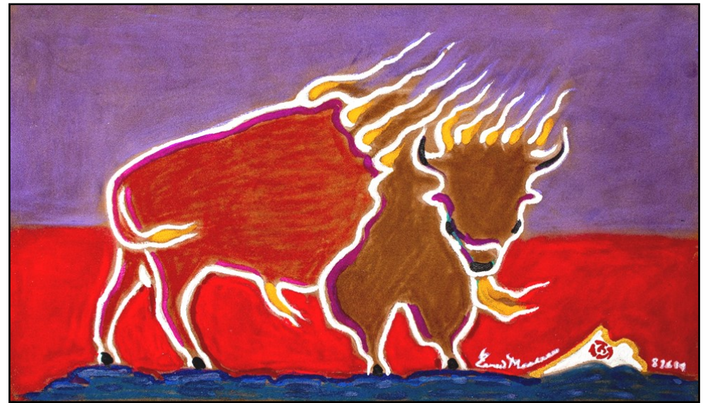
Little Bull Pastel and Acrylic on Velvet © 2019 Ernest Marceau