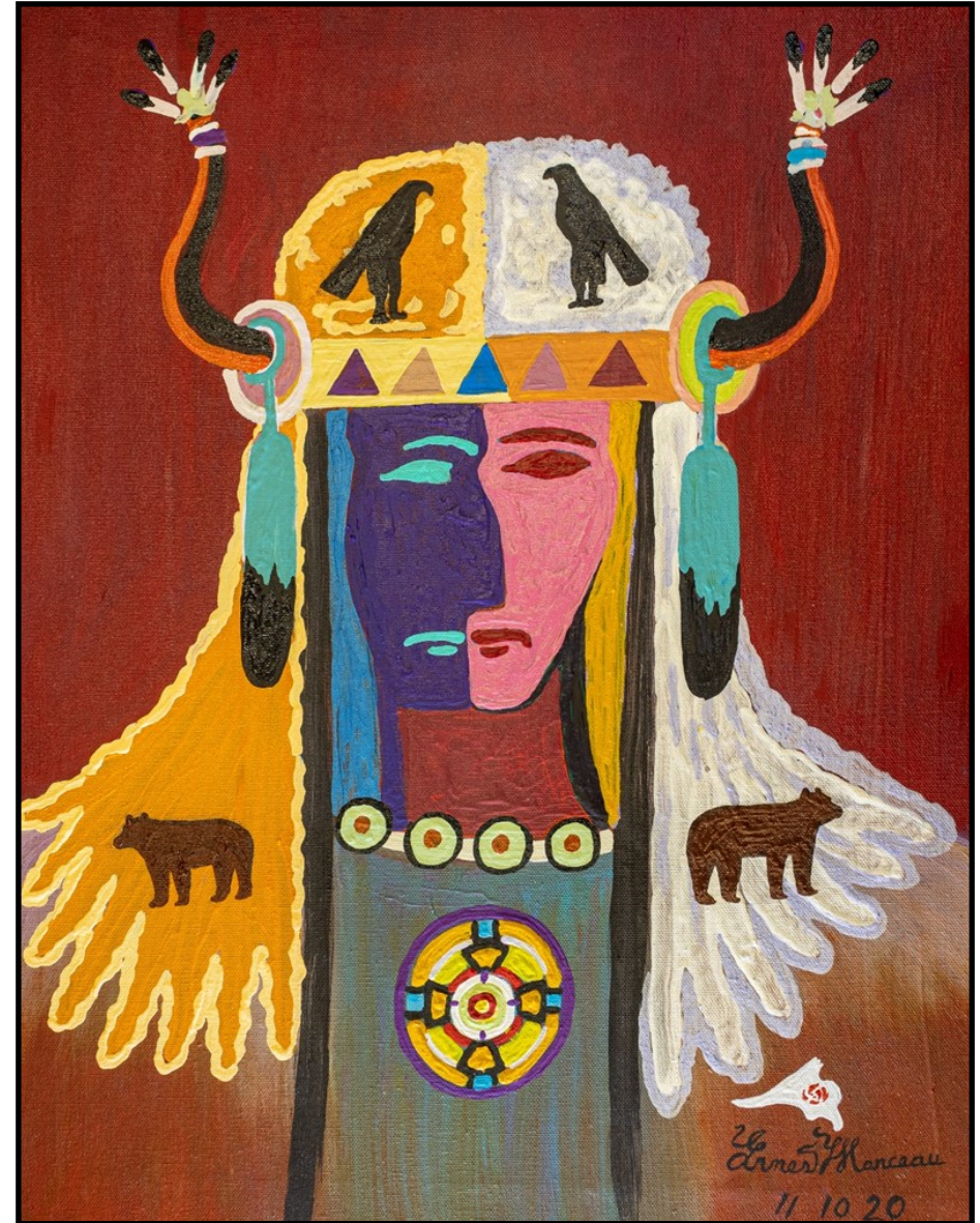
Warrior of Two Worlds Acrylic on Stretched Canvas © 2020 Ernest Marceau