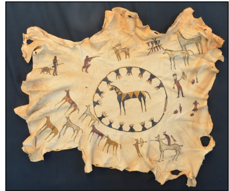
White Quiver Smoked Deer Hide Painting © 2019 David Dragonfly