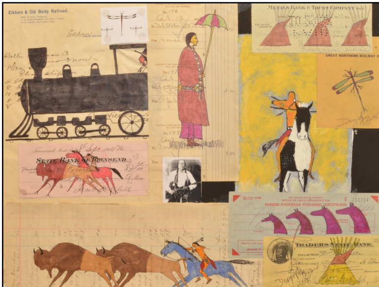
Untitled Collage Mixed Media © 2019 David Dragonfly