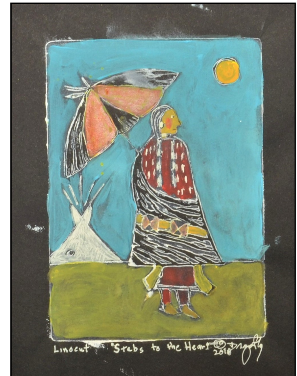
Stabs to the Heart Linocut