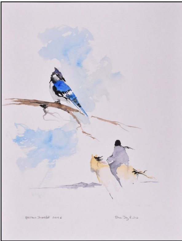
Blue Jay Rider ( Zintkato gleglege Suntkakayanka ) Watercolor on paper © 2019 Arthur Short Bull