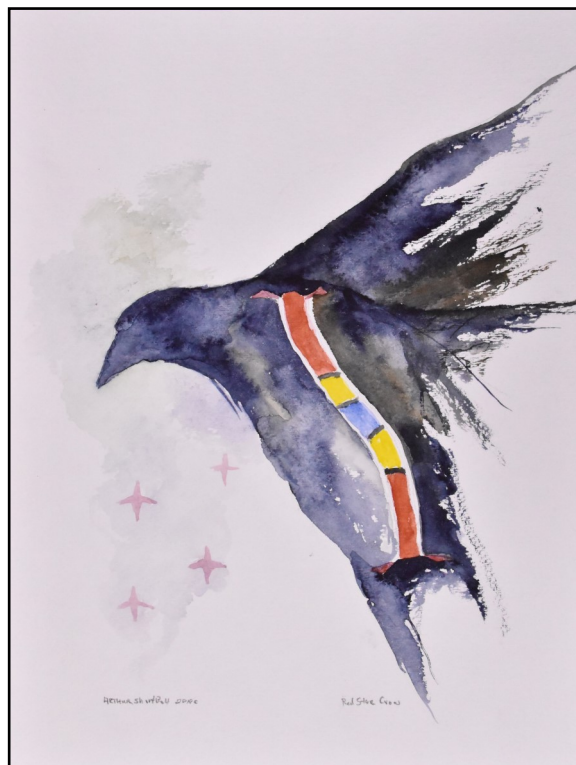
Red Star Crow ( Wicapi Luta Kangi ) Acrylic paint and mixed media on canvas © 2021 Arthur Short Bull