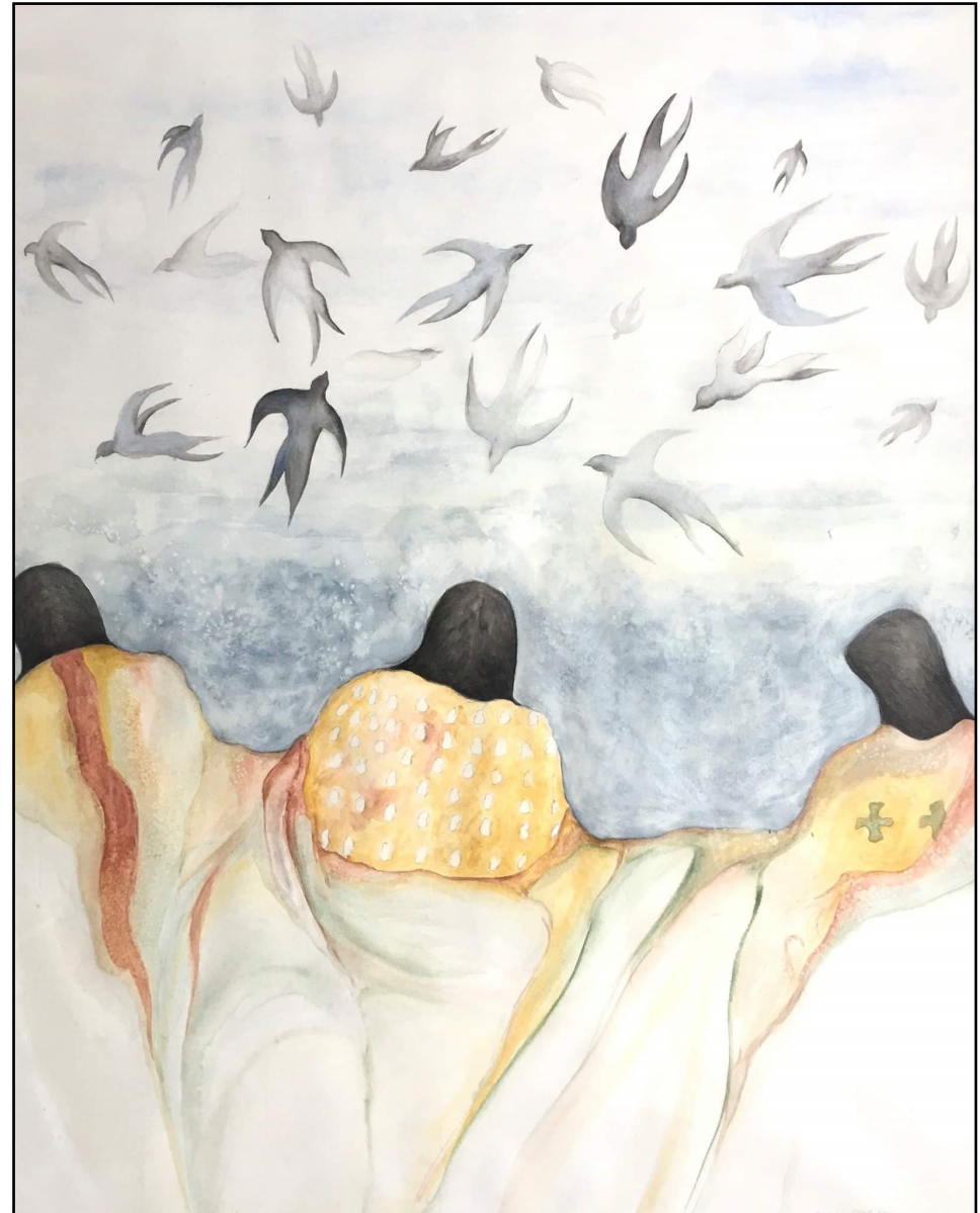
Messengers of Wakinyan