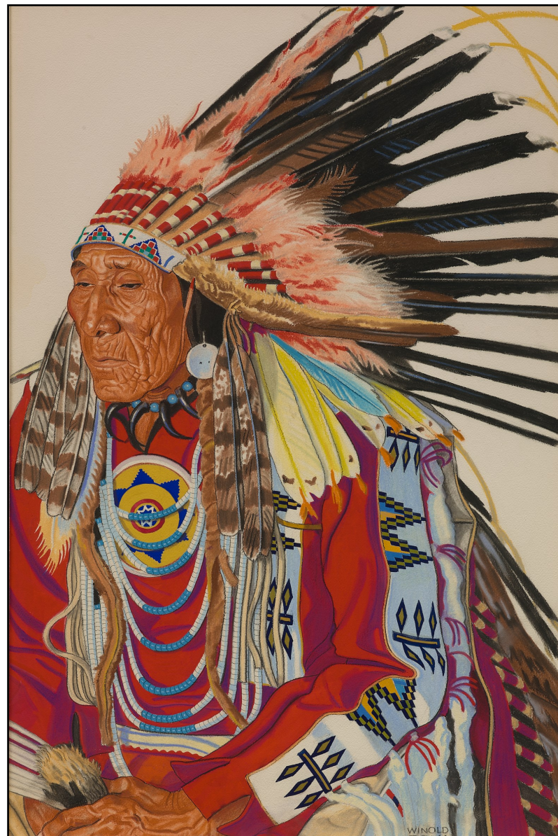
Turtle Winold Reiss 1943

Pastel on Whatman board