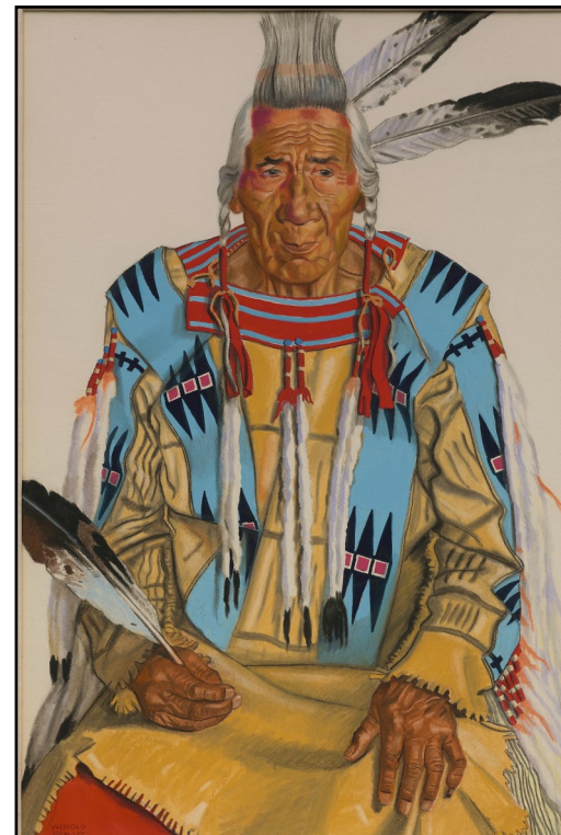
Weasel Tail 1943 Winold Reiss Pastel on Whatman board Image courtesy of BNSF Railway Foundation