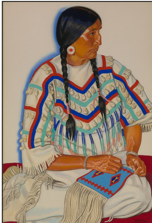
Kills Instead 1943 Winold Reiss Pastel on Whatman board