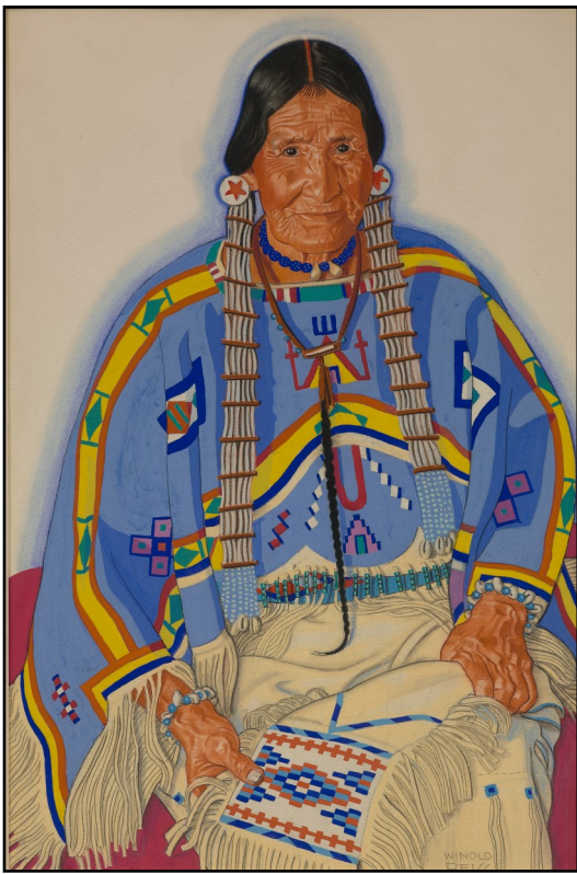
Julia Wades in the Water Winold Reiss 1943 Pastel on Whatman board