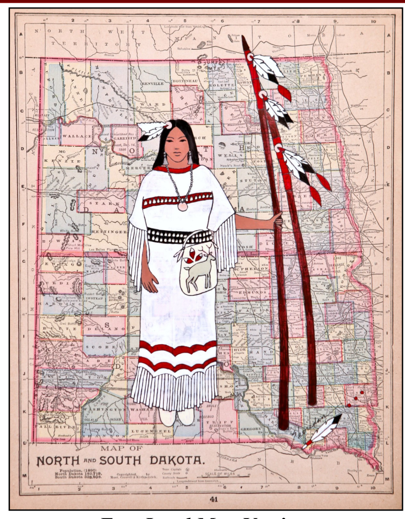
Eva, Land Map Version Ink and gouche on antique map © 2022 Sheridan MacKnight

Strong Heart Woman featuring Sheridan MacKnight